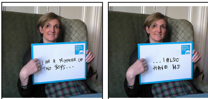
Good lighting, big clear text and images are in focus